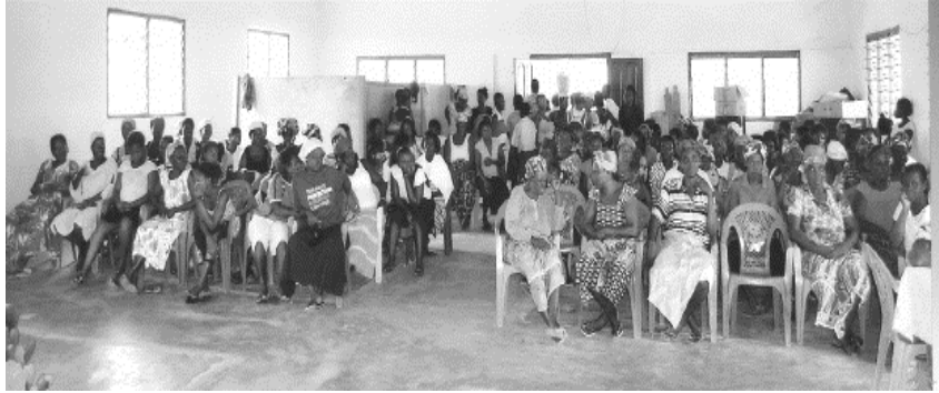
Women waiting to be screened